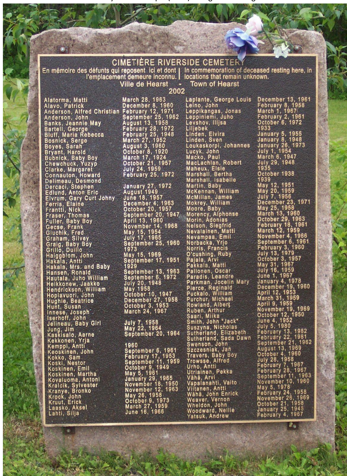
APPENDIX 2. Riverside Cemetery Bronze Plaque (2002) listing unmarked graves.