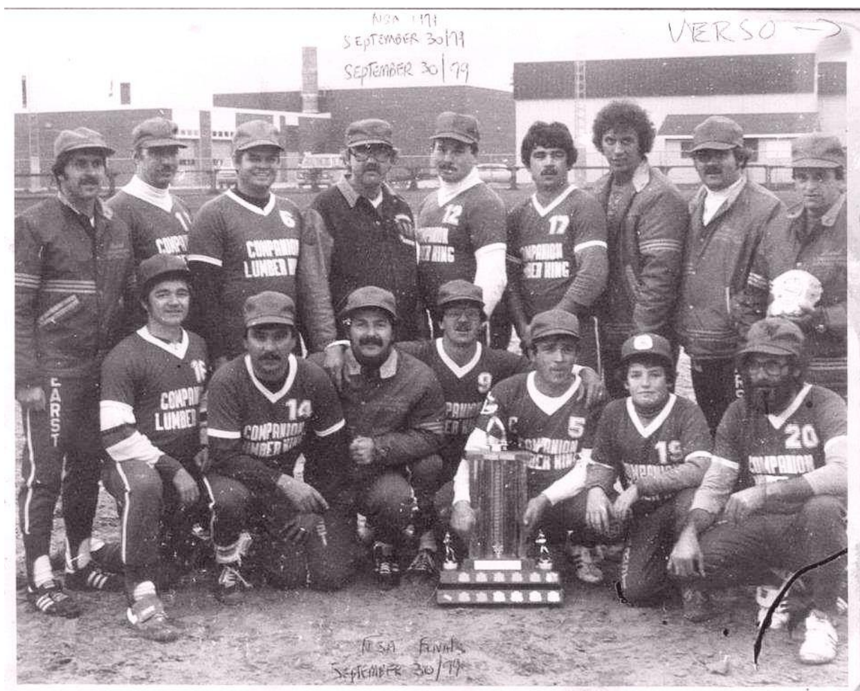
1979 - NSA Softball Champs (same team as 397)