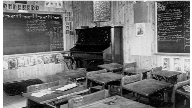
Bradlo classroom in 1934

Fun and laughs were a result of "night school" classes for the adults, mostly men. Besides learning to converse in English, time was spent on bank forms, understanding business letters received and various topics suggested by the group.