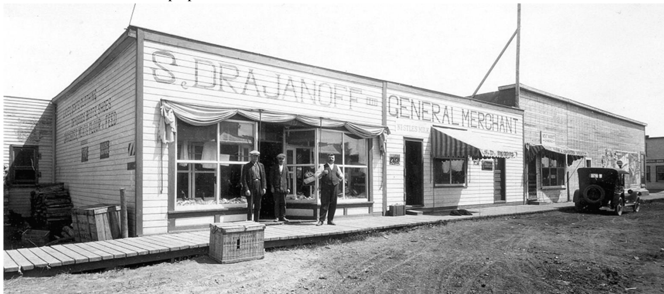
Drajanoff Store on the East Side of 9th Street –about 1930 ( later West & Co )