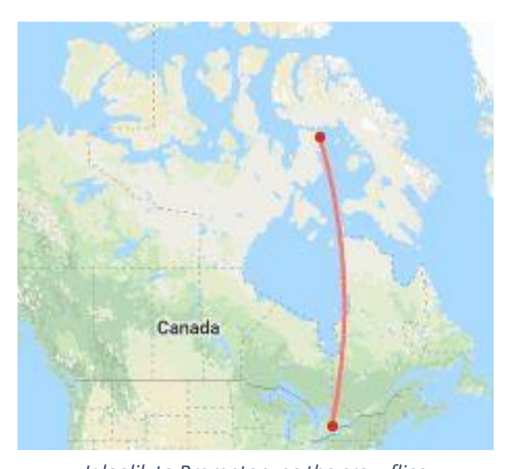
Igloolik to Brampton, as the crow flies

When she went looking for it after Christmas, all she found were a few fragments of the ajeguang on her dog's pillow. Gypsy had enjoyed a special breakfast of fresh seal bones imported from the Arctic, almost 3,000 km. away. A twist on the classic "the dog ate my homework" excuse.